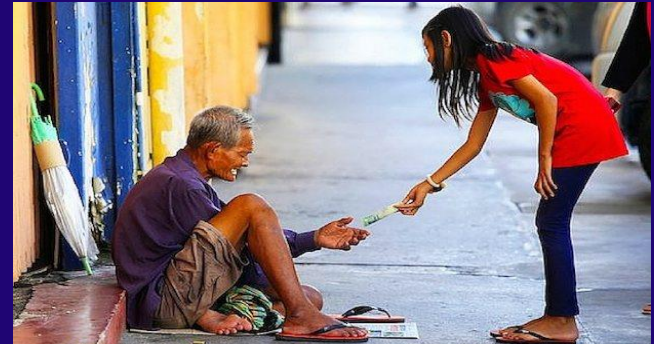
"No one has ever become poor by giving"

No more poverty, No more hunger! And no more homeless people. We will set up shelters for the poor and homeless. we will get cloths and take care of our their needs we will help them